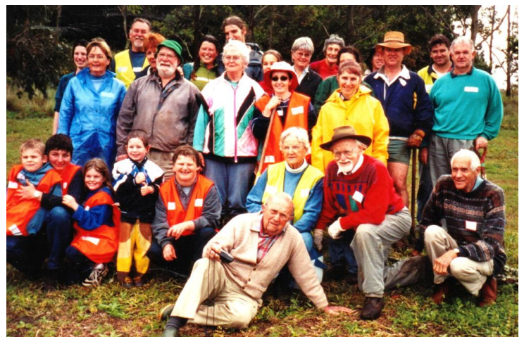
The first planting 25 August 2002